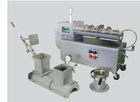
Easy Access and Maintenance

Main body 140 kg, Clay roller stand 5 kg