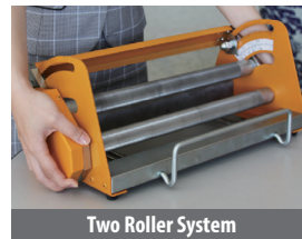
Two Roller System