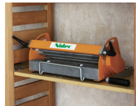
Lightweight, Compact and Portable